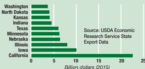
Top ten states for U.S. agricultural exports, by value

In California, tree nuts account for the largest share of exports. Soybeans are the most valuable export in five of the top ten exporting states, including Iowa, Illinois, and Nebraska. Other leading export products for states in the top ten exporters include cotton, wheat, and fruits.